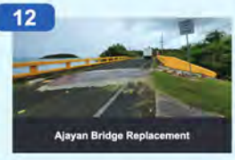
12 Ajayan Bridge Replacement