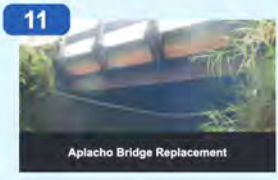
11 Aplacho Bridge Replacement