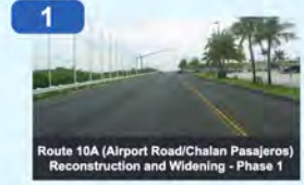
1 Route 10A (Airport Road/Chalan Pasajeros) Reconstruction and Widening - Phase 1